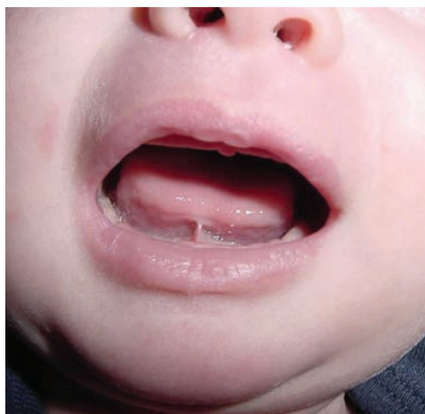
Figure 2. Infant with a short frenulum that, while breastfeeding, caused nipple damage in the mother, resulting in repeated episodes of mastitis. Treatment for the mother consisted of oral antibiotics and topical mupirocin (Bactroban). Once the infant had a frenotomy, she discontinued damaging her mother's nipples, gained weight appropriately, and continued breastfeeding for many months.

Infant mouth abnormalities (e.g., cleft lip or palate) may lead to nipple trauma and increase the risk of mastitis. Infants with a short frenulum ( Figure 2 ) may be unable to remove milk effectively from the breast, leading to nipple trauma. Frenotomy can reduce nipple trauma and is usually a simple, bloodless procedure that can be performed without anesthesia. 15 The incision is made through the translucent band of tissue beneath the tongue, avoiding any blood vessels or tissue that can contain nerves or muscle. 11